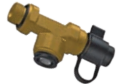
Run Test Point Tee