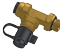
Run Test Point Tee