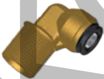
Bulkhead Elbow - DIN2353

Other configurations available on request