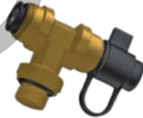
Branch Test Point Tee